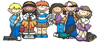
Tidy Class - 3H